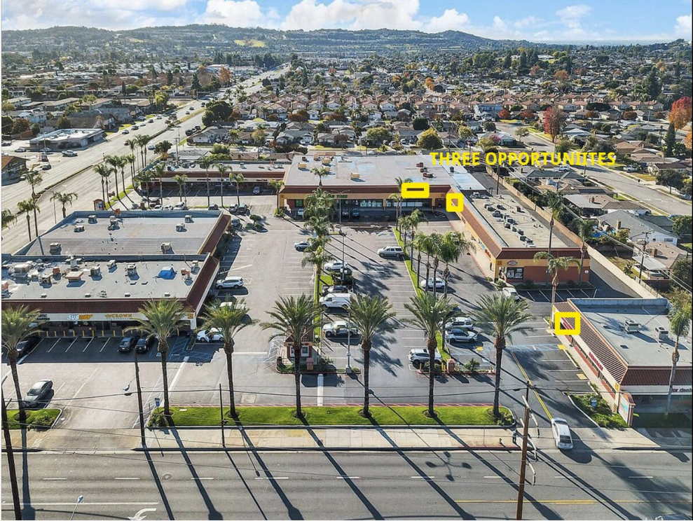
OVERVIEW 3 OPPS