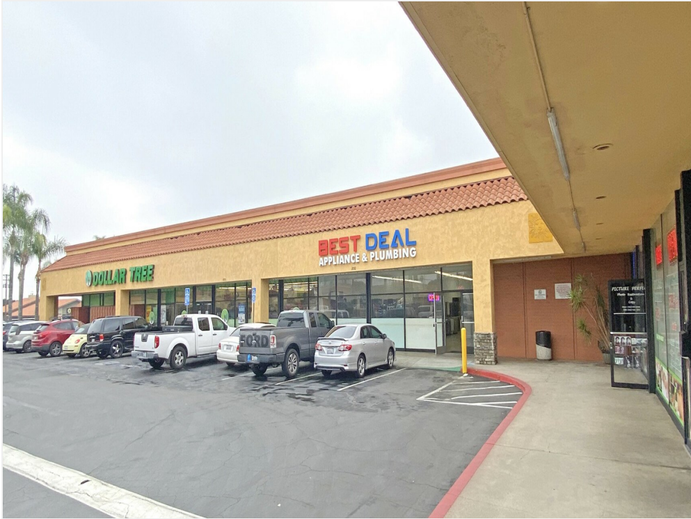
2050-2080 W La Habra Blvd - Plaza Del Sol