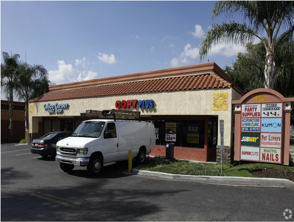
2094-2096 W La Habra Blvd