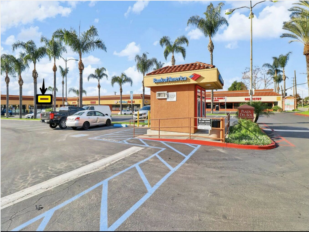
10,000 SF SPACE LA HABRA VIEW