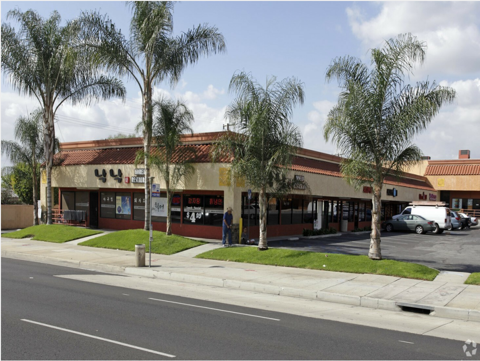
141-151 S Beach Blvd