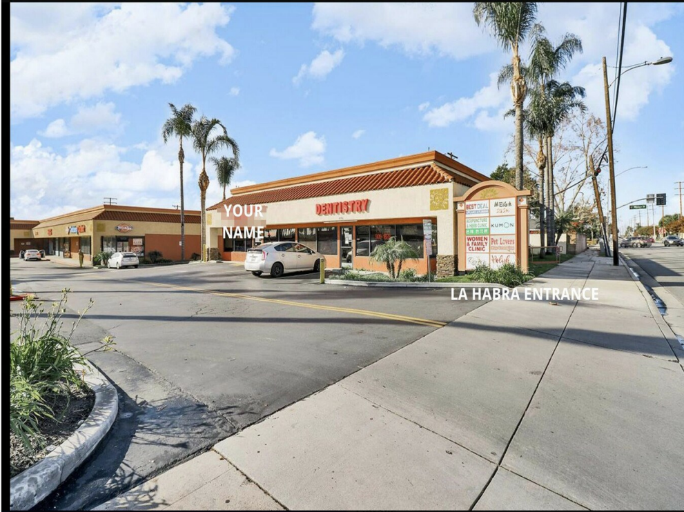
1500 SF LA HABRA ENTRANCE