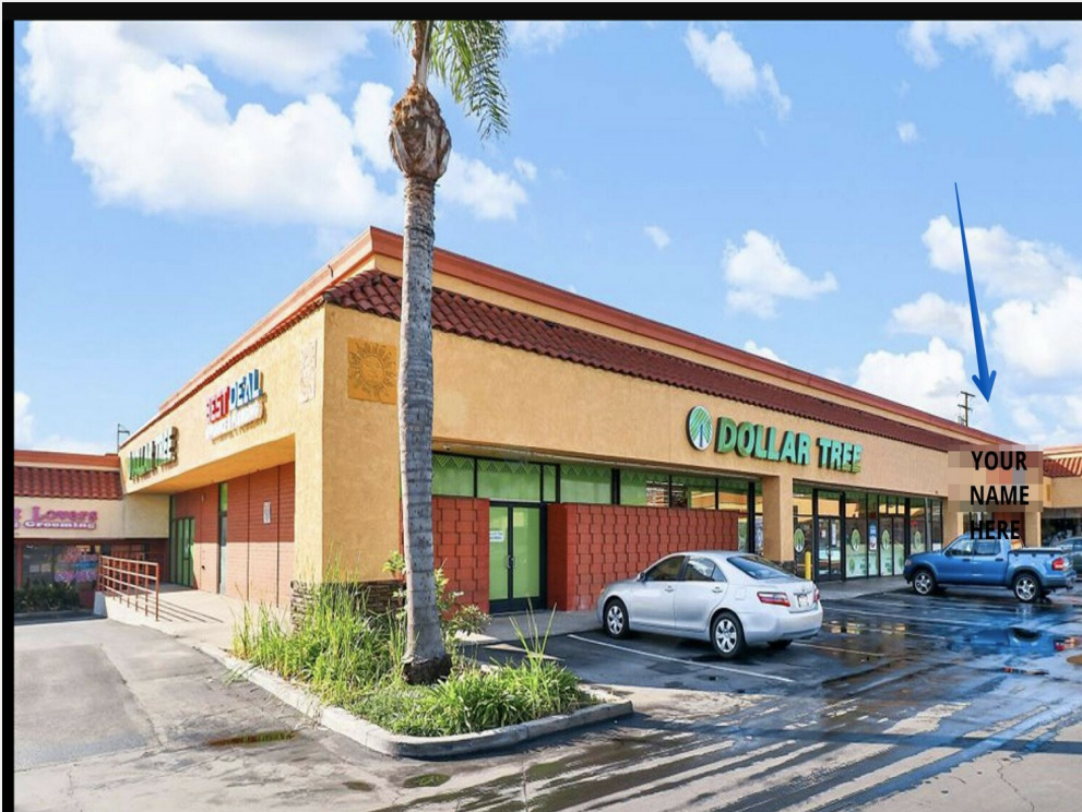
10,000 SF SPACE